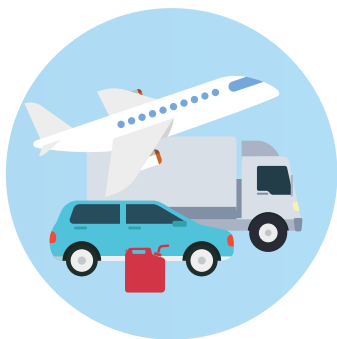
TRANSPORTATION FUELS gasoline, diesel and jet fuel