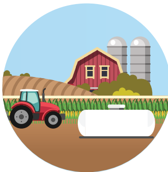
RURAL HOME HEATING AND AGRICULTURAL FUELS propane