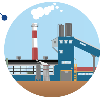
INDUSTRIAL FEEDSTOCKS ethane, propane and butane