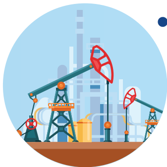
TRANSPORTATION FUEL FEEDSTOCKS crude oil