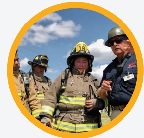
Any incident will have a unified command to coordinate response activities