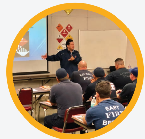
Operators and first responders train on potential pipeline scenarios

Pipeline operators partner with first responders to protect the public and environment during pipeline incidents